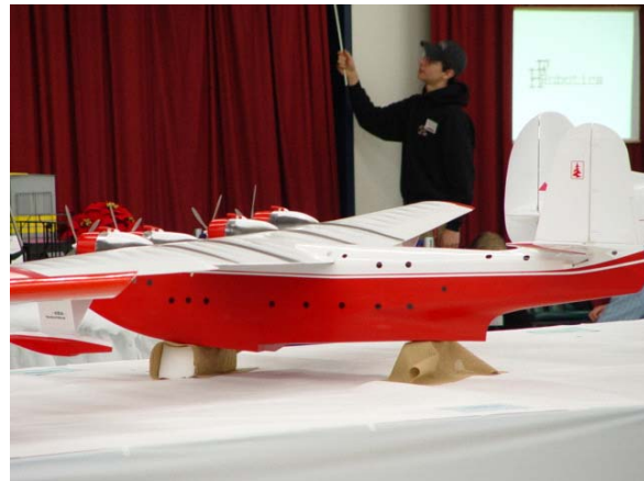
Martin Mars flying boat, in fire fighting service.