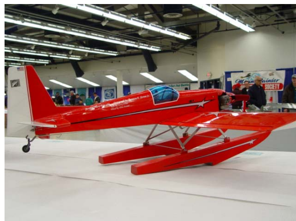
A very large Four Star on floats