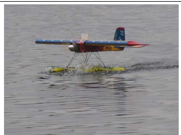
Bean Drop Contestant

More than 50 folks attended our picnic May 12 in spite of the rain. Several were local neighbours of the field.