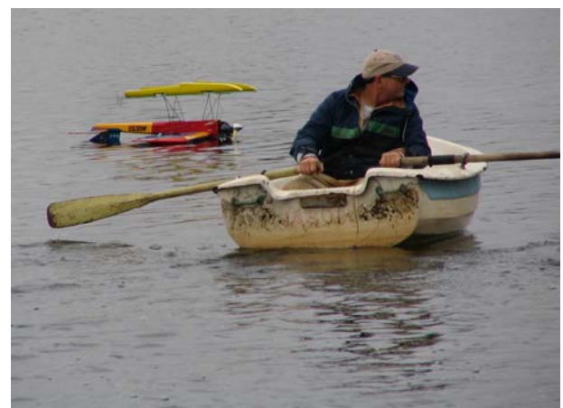
Recovery in Progress